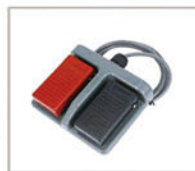
Foot Switch Adjust front window height by foot during experiment, to avoid airflow turbulence caused by arm movement.