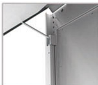
Iron hook support rod for panel support