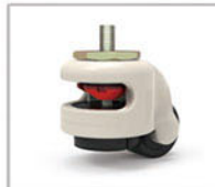
Footmaster Caster Universal caster with brake and leveling feet.