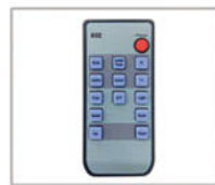
Remote Control All functions can be realized with it, making the operation much easier and more convenient.

E-mail: export@biobase.com www.biobase.cc / www.biobase.com