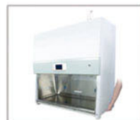
Cabinet Support Block Easy to lift, prevent hand pressing