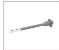
Wind Speed Sensor & EC Fan