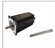
Stepper Motor and Handle The front window can be controlled manually or electrically