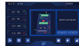
Color Touch Screen Touch operation, real-time and clearer display of various values and appointment timing function.

E-mail: export@biobase.com www.biobase.cc / www.biobase.com